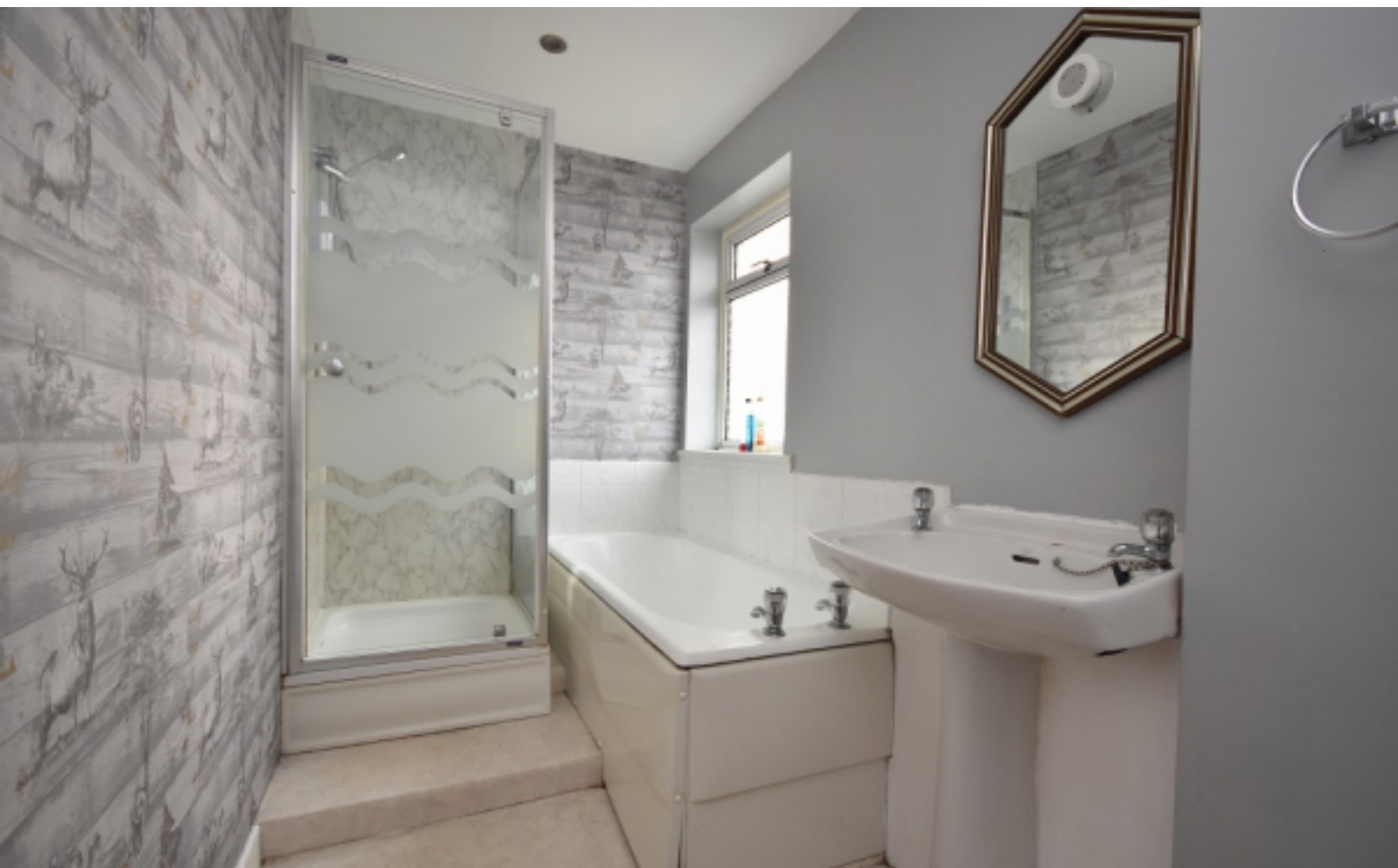
129 WEST ROAD BATHROOM