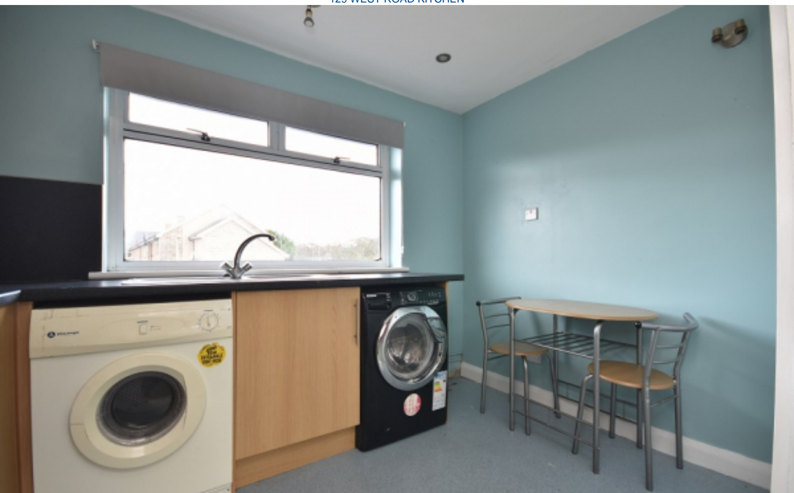
129 WEST ROAD KITCHEN ALT