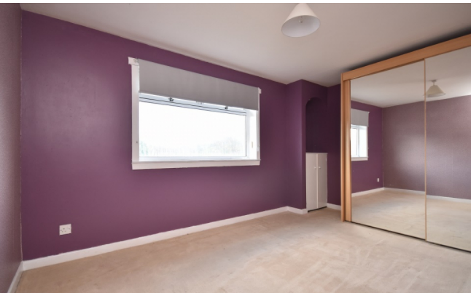
129 WEST ROAD BEDROOM