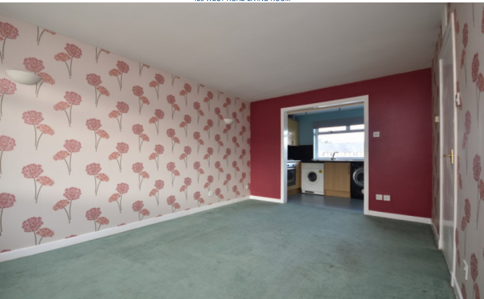
129 WEST ROAD LIVING ROOM ALT