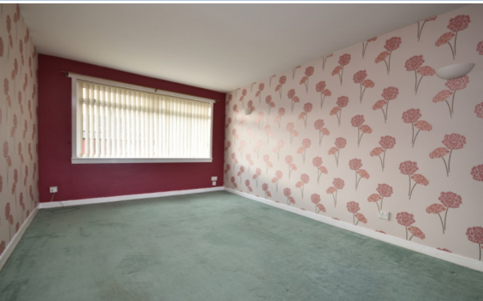
129 WEST ROAD LIVING ROOM