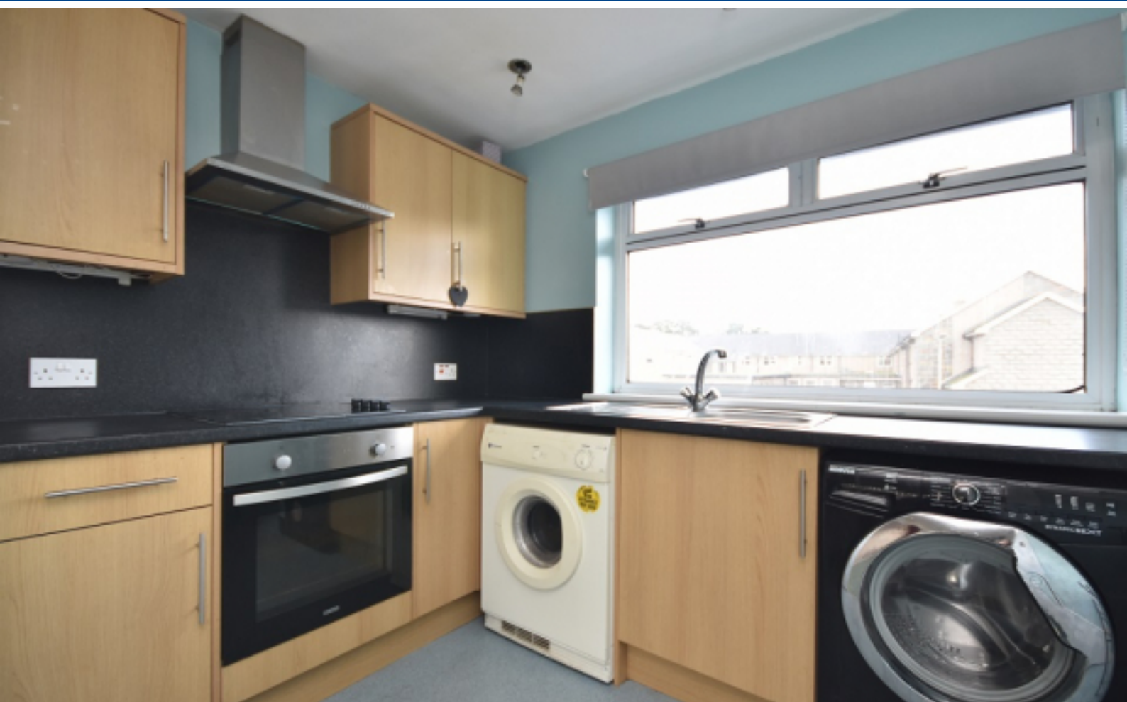
129 WEST ROAD KITCHEN